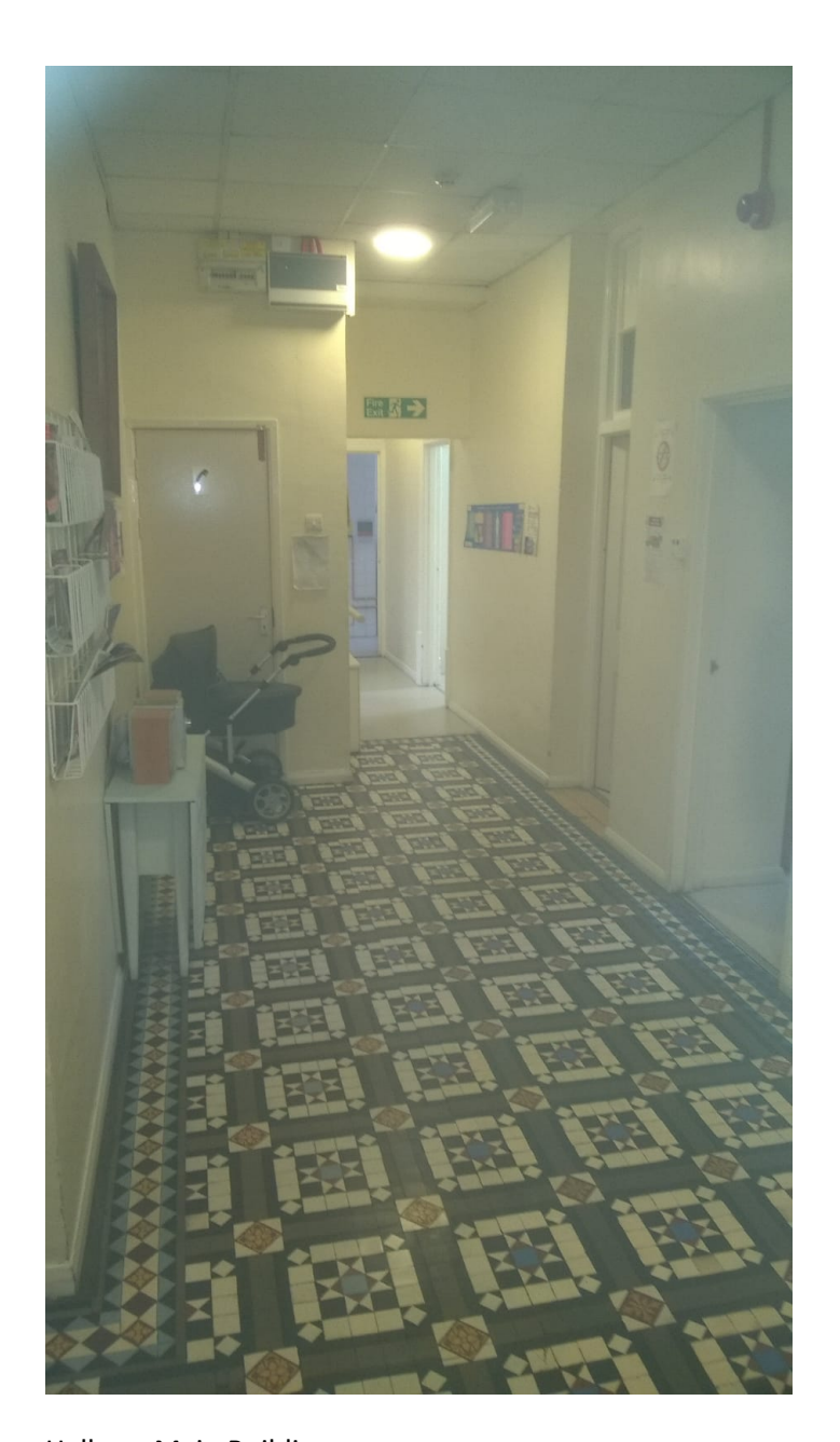
Hallway Main Building