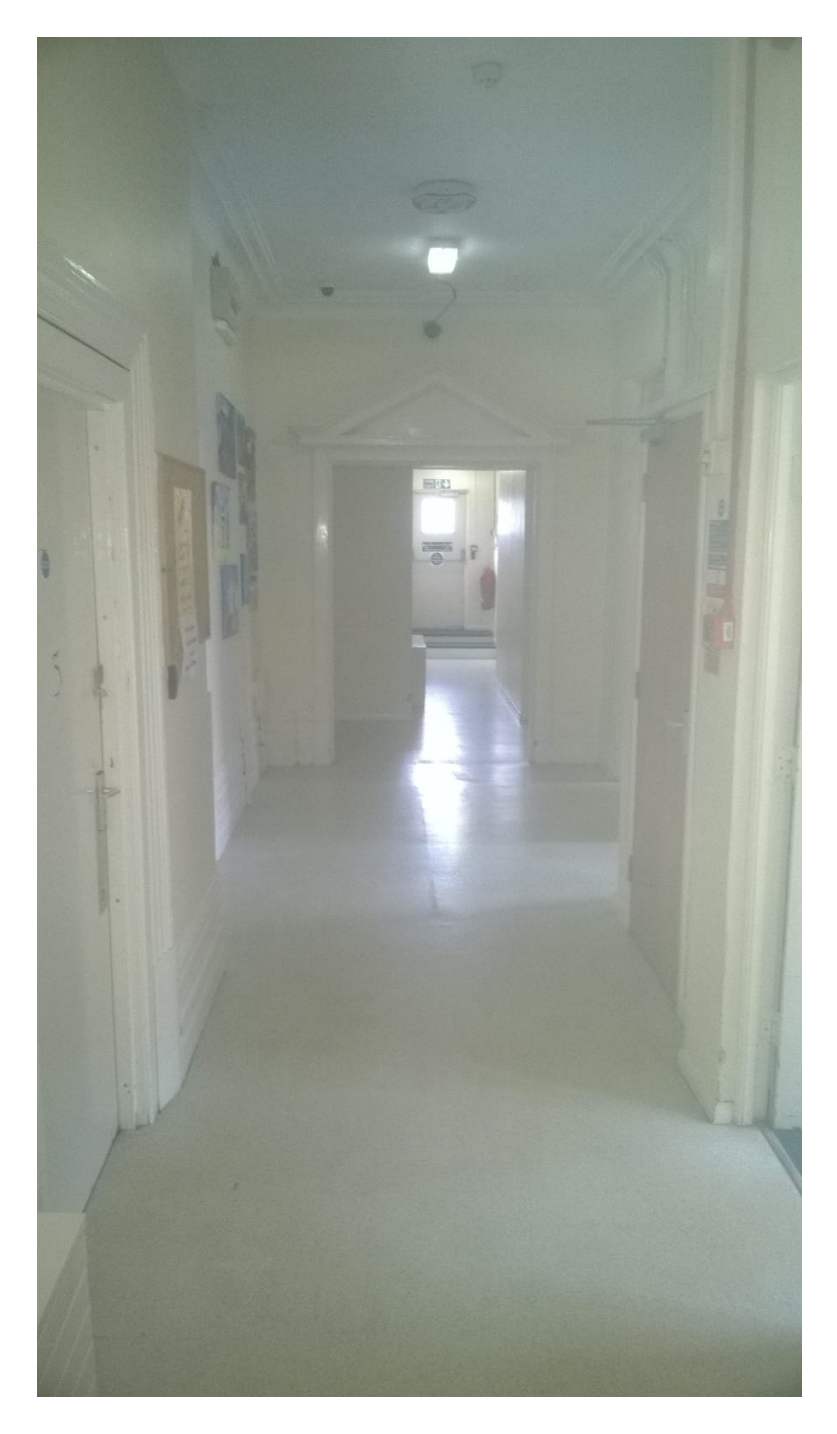
First Floor Corridor – main building

Shared washing Facilities (main building)