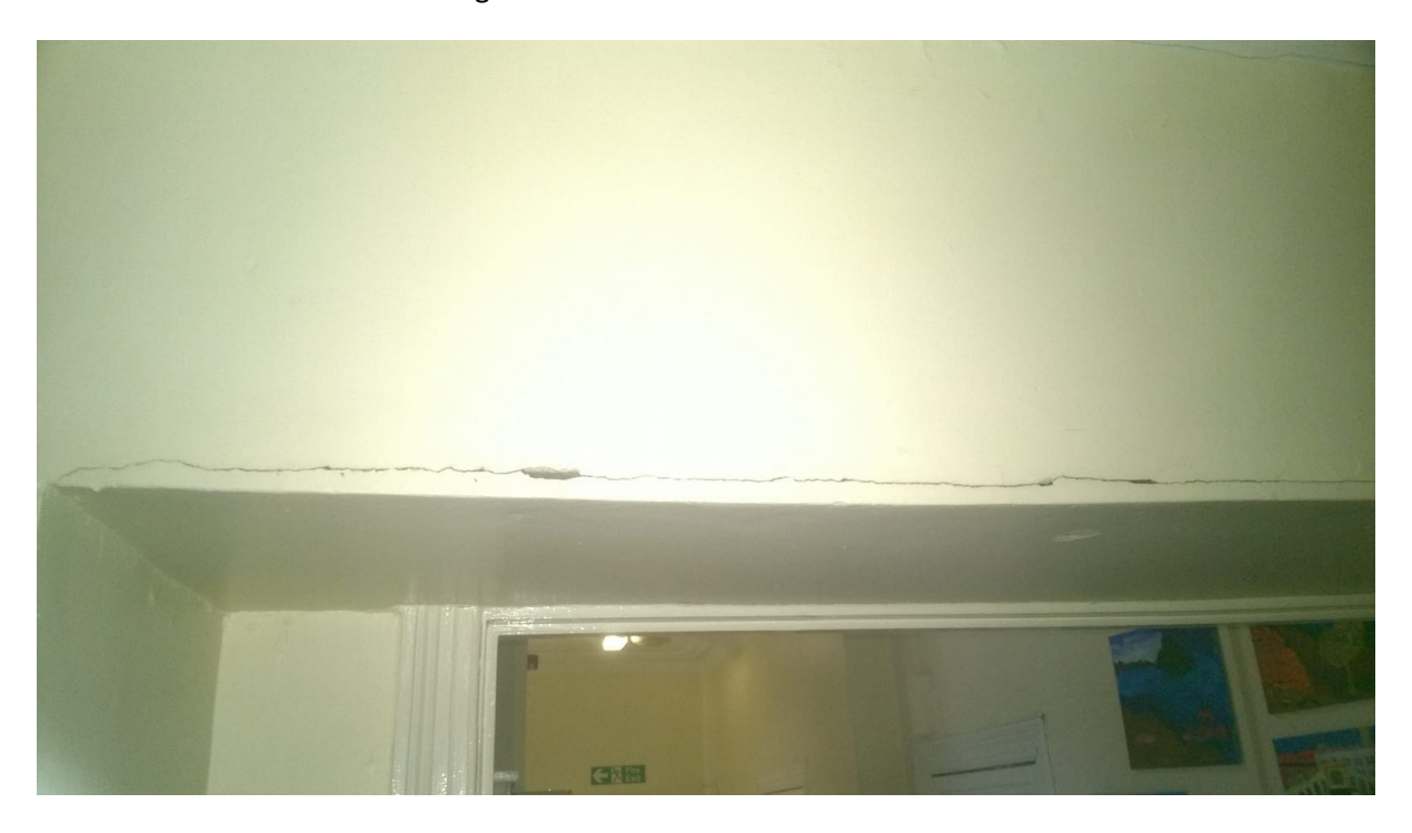
First floor corridor – main building