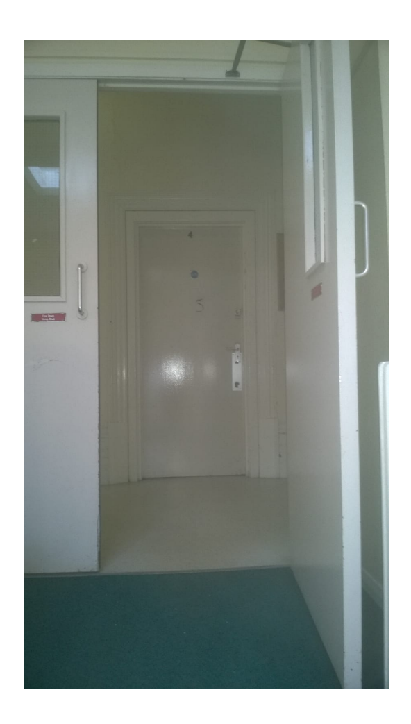
First floor corridor – main building